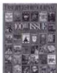
Following Jesus Issue 100 (#903)