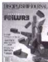
Redeeming Failure Issue 109 (#912)