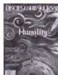
Humility Issue 105 (#908)