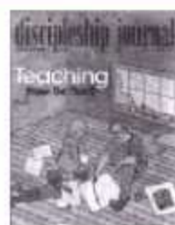
Teaching Issue 82 (#35137)