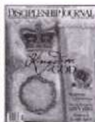
The Kingdom of God Issue 108 (#911)