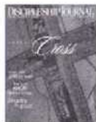
Embracing the Cross Issue 110 (#913)