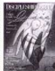
From Guilt to Grace Issue 92 (#36192)