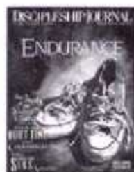
Endurance Issue 96 (#38144)