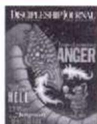
Transforming Anger Issue 87 (#33959)