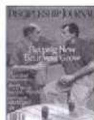
Helping New Believers Grow Issue 107 (#910)