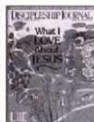
What I Love About Jesus Issue 102 (#905)